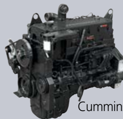
Eco-friendly Cummins QSM11 Engine

3 Mode Clutch Cut-Off System L(Low) Mode : Short distance & faster loading M(Medium) Mode : General loading H(High) Mode : Slope ground & inching