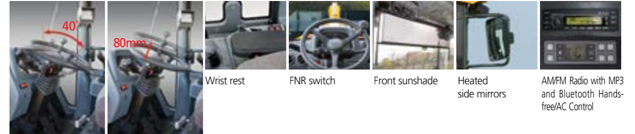
Tilting / telescopic steering column

In the 9 series cabin you can easily adjust the steering column and wrist rest to best suit your preferred comfort level. Pilot-operated joystick controls are easy and comfortable to operate. An FNR (Forward/Neutral/Reverse) switch on the control lever facilitates easy selection of travel direction. Roller type sunshades on the front window and rear window allow the operator to reduce glare and improve visibility. Heated side mirrors feature built-in hot wires for quick defrosting during cold weather conditions.