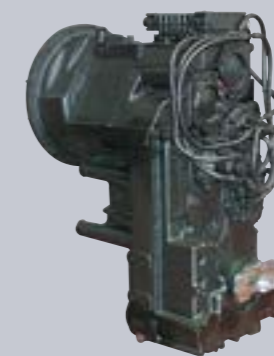
Fully Automatic Transmission

The CUMMINS QSM11 electronic control engine combines full-authority electronic controls with the reliable performance. The combination of improved airflow and evenly dispersed fuel results in increased power, improved transient response and reduced fuel consumption. And the QSM11 uses advanced electronic controls to meet the emission standards. (EPA Tier-3, EU StagIII-A)