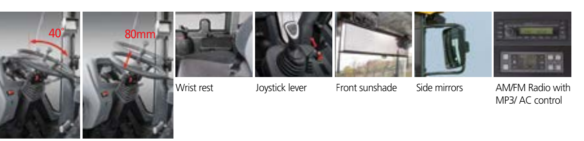
Tilting / telescopic steering column(OPT)

and improve visibility. Heated side mirrors feature built-in hot wires for quick defrosting during cold weather conditions.